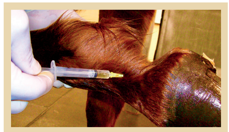
Figure 1. Arthrocentesis/joint tap procedure: (https://medium.com/@equinelameness/so-what-exactly-are-joint-injections-in-horses-4af76709ebc8)

Joint flare (reactive synovitis) is an inflammatory reaction that may occur in response to introducing any chemical substance (such as a medication) into a joint. Unlike a joint infection, a joint flare is not caused by bacteria, so it cannot be prevented with antibiotics. Signs are similar to joint infection and include mild to severe lameness, pain, and swelling of the joint typically within 24-48 hours of an injection. Some clinicians suggest administering a concurrent systemic NSAID (non-steroidal