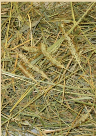
Figure 3. Above are two different presentations of foxtail in hay. The distinctive seed head makes foxtail readily identifiable.