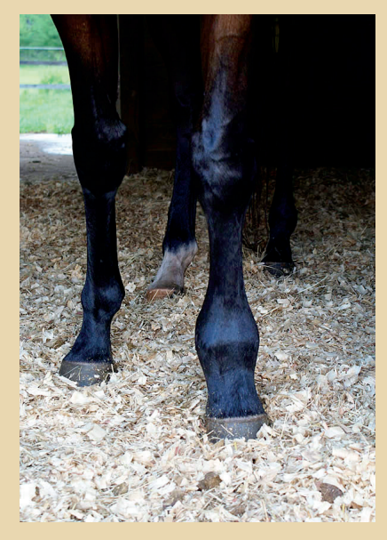
Figure 2. Swelling of the fetlock joint: (http://horsesinthesouth.com/blog/61609-dsc09679)

anti-inflammatory) at the time of tapping in order to reduce the risk for flare. This condition is much less threatening but does require urgent treatment.