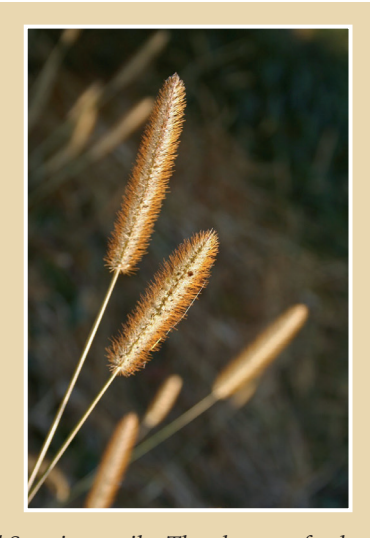
Figure 1. Left to right, Setaria viridis and Setaria pumila. The plume or feathery appearance of the seed head is what gives the foxtail its common name.

In the horse world, foxtails are primarily a problem when they are present in hay (Figure 3). Foxtail grows best during times of drought as it is adapted to high temperatures and prolonged sun exposure. Horses can consume the stem of the foxtail without adverse effect, but when the diaspore (seed head) is consumed, the barbs detach and become lodged in the gums, lips, and other oral mucosa. Continued consumption of foxtail-contaminated hay or pasture leads to mucosal irritation with clinical signs including excessive salivation, difficulty in chewing/eating and a foul oral odor. In severe cases it can lead to complete inappetence due to inflammation and ulceration of the gums, tongue and other oral mucosal surfaces (Figure 4). (continued on page 2)