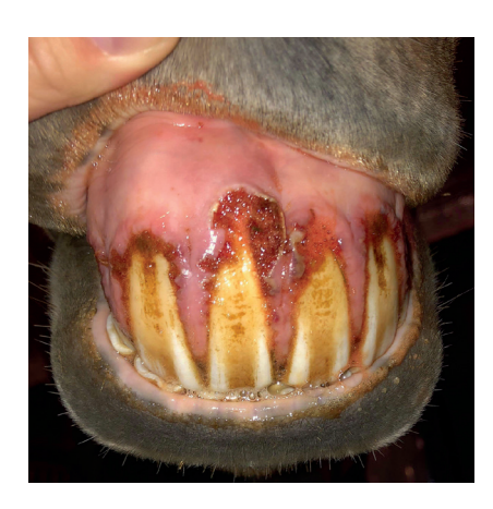
Figure 4. Foxtail barbs causing ulceration of the gum around the incisors. The "fuzzy" appearance is actually a mat of embedded foxtail barbs.

Foxtail consumption is a significant problem that affects the equine community, and it is important to remember that not all horses that consume foxtail-infested hay will be affected in the same way. Just as with bee stings or drug reactions, all horses respond uniquely to the foxtail they ingest, and rarely are all horses in a barn affected. It is important to remember to monitor roughage for the presence of foxtail and be prepared to treat affected animals if foxtail is fed intentionally or accidentally. As hay consumption begins or increases in late fall and winter, this is the most common time to see foxtail barb complications. For this reason, we recommend checking the oral cavity for foxtail ulcerations once hay is fed continuously and contacting your veterinarian if oral pain or ulceration is noted.