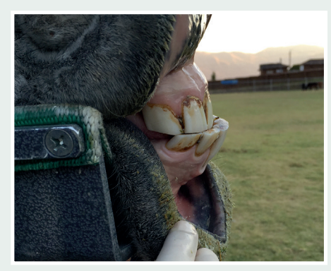
Figure 2a. Left: Severe over-bite (parrot mouth) in a young horse. (http://www.mwveterinaryservices.com/equine-dentistry-photos.html) Figure 2b. Right: Under-bite in a mature horse. (Photo Courtesy of Dr. Stacy Tinkler).